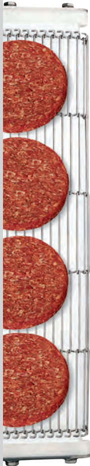
Usable mold plate area 15 3/4" (400mm) wide by 6" (152mm) front to back