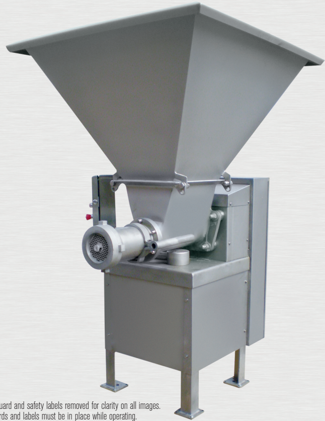
Plate guard and safety labels removed for clarity on all images. All guards and labels must be in place while operating.

Built into the feedscrew for greater drive strength.